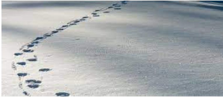
Wolf tracks in snow